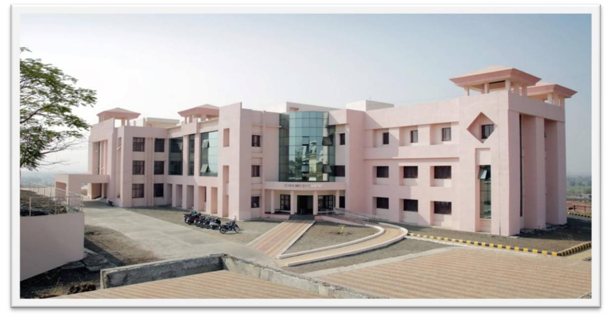
School of Education, MGAHV (Central University), Wardha, Maharashtra